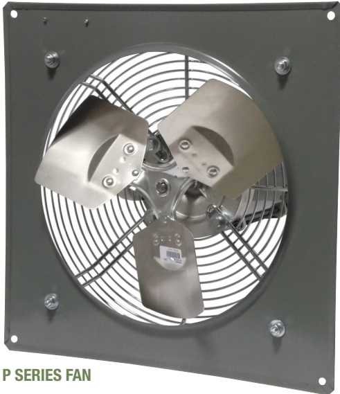
P SERIES FAN