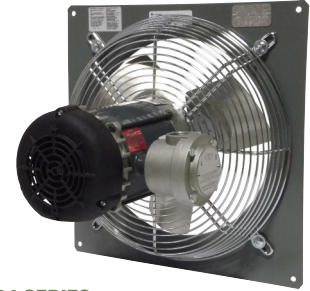
P4 SERIES EXPLOSION PROOF MOTOR

Designed for Industrial, Commercial & Farming applications.