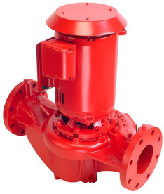
Vertical Inline Close Coupled