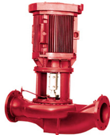
Vertical Inline Split Coupled