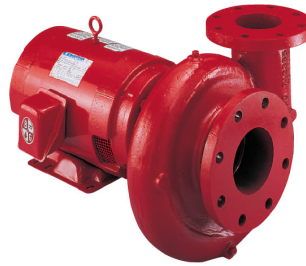
End Suction Close Coupled