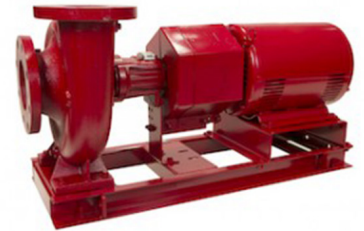
Base Mounted Coupled