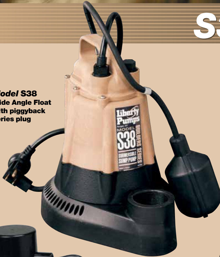
Model S38 Wide Angle Float with piggyback series plug