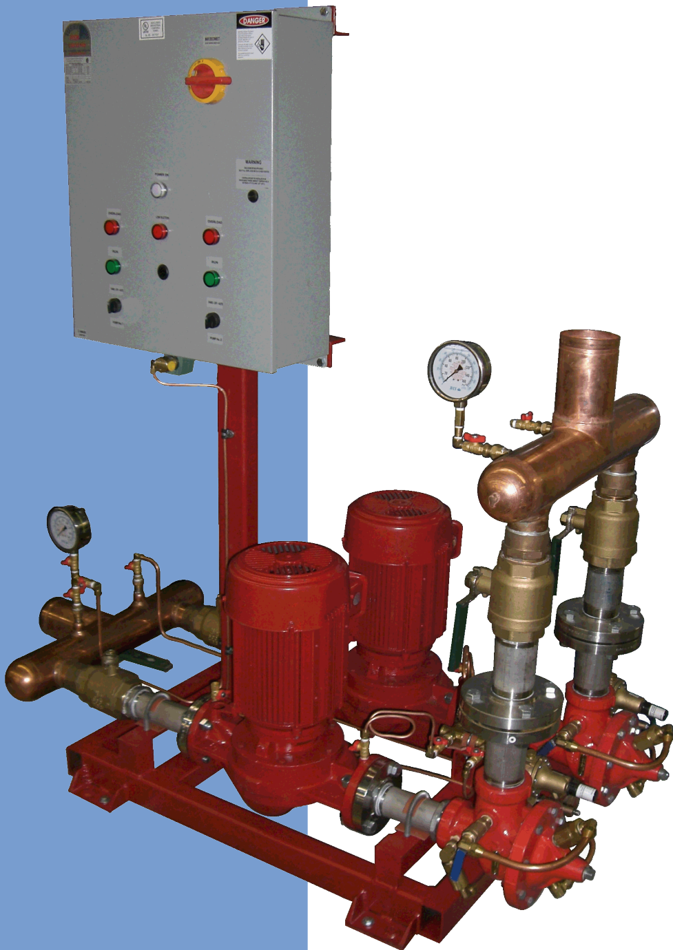
Custom Package Shown