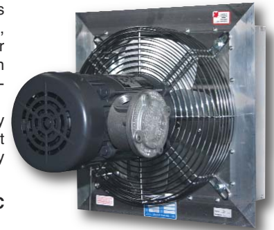
EXPLOSION PROOF MOTOR