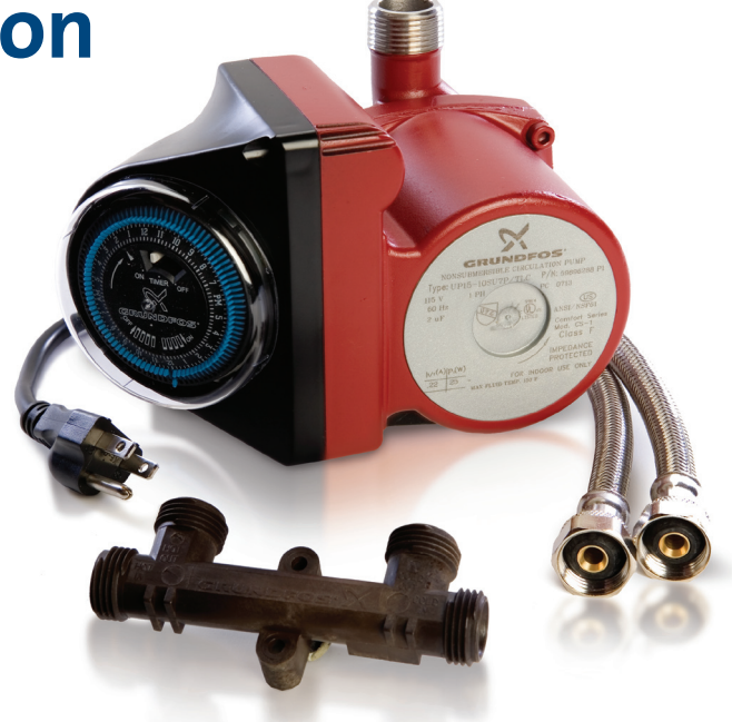
UP 15-10 SU7P TLC (Part# 595916) Pump, valve, line-cord, and (2) S.S. flex hoses.

For more information about the Grundfos Comfort System go to: