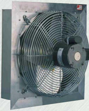
AX SERIES MOTOR

The AX series housings are constructed of heavy duty aluminum with built in shutters that automatically open when the fan starts and gravity closes when the fan stops.