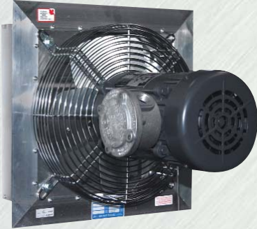
EXPLOSION PROOF MOTOR